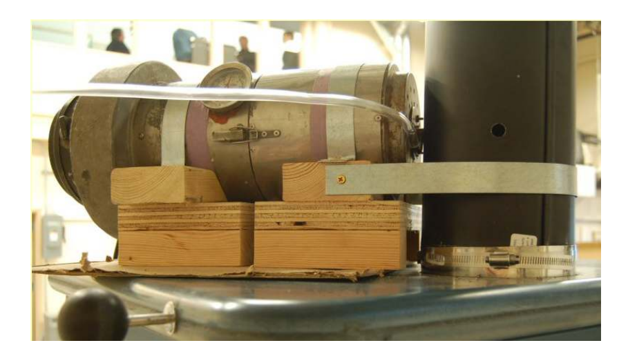
Pic. 1: Condar dilution tunnel

0.2 raw liters per second and dilutes them with ambient air at a 10:1 ratio before depositing them on dual glass fiber filters (primary filter plus backup). A second probe at the same height sampled the flue gases with a Testo 330-2 gas analyzer which gives flue gas temperature, O2 and CO concentration. This normally allows calculation of a PM emissions factor in grams of PM per kg of dry fuel burned. There was a malfunction with the Testo system, and insufficient flue gas data was obtained. Therefore, the results are reported as the filter catch of particulates. The PM weights can be compared directly, due to the methodology of alternating samplers at short intervals.